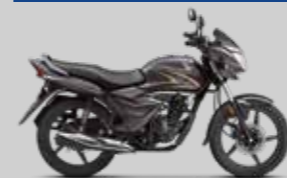
MATTE AXIS GREY