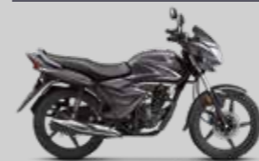
GENNY GREY METALLIC